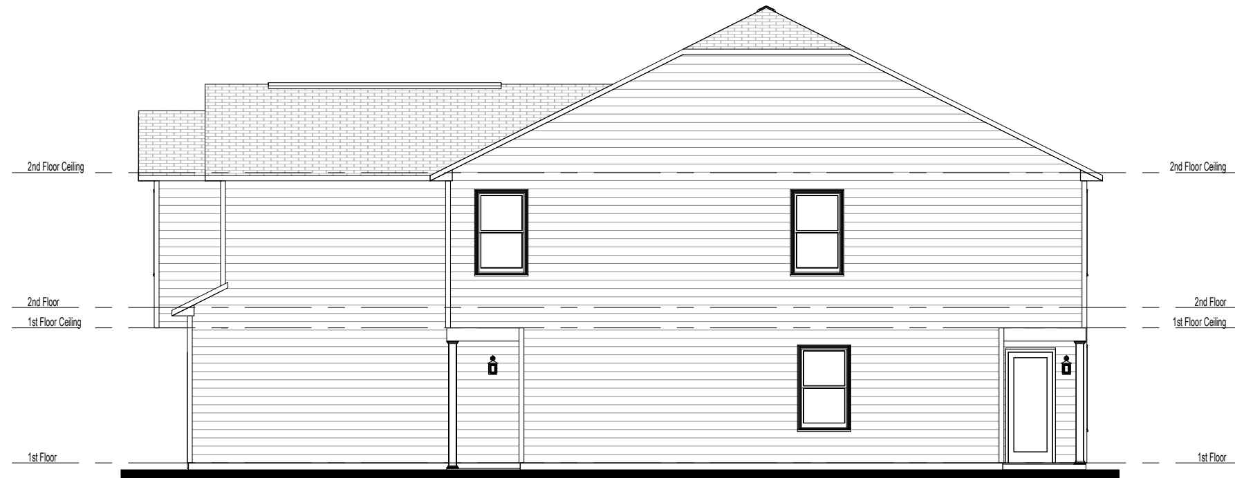
② Right Elevation - Elev B 1/8" = 1'-0"