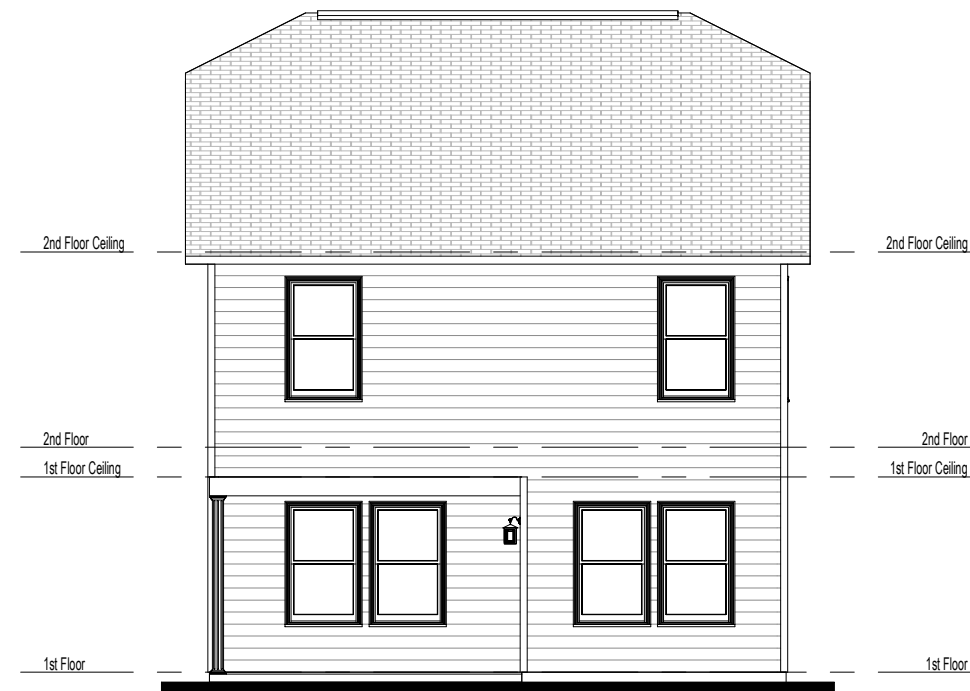
② Rear Elevation - Elev B 1/8" = 1'-0"