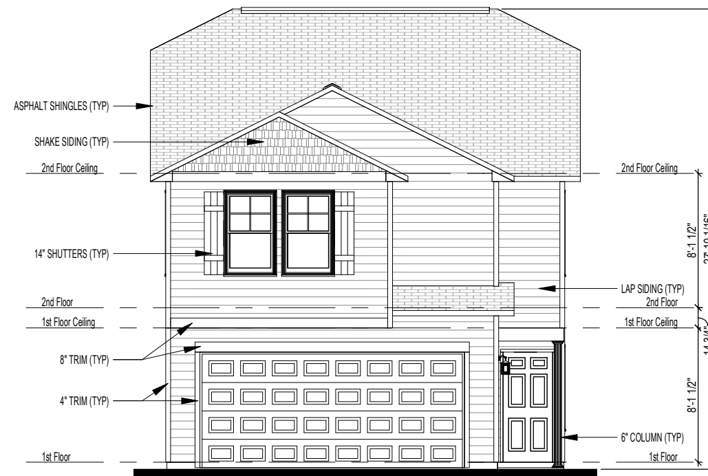
① Front Elevation - Elev B 1/8" = 1'-0"