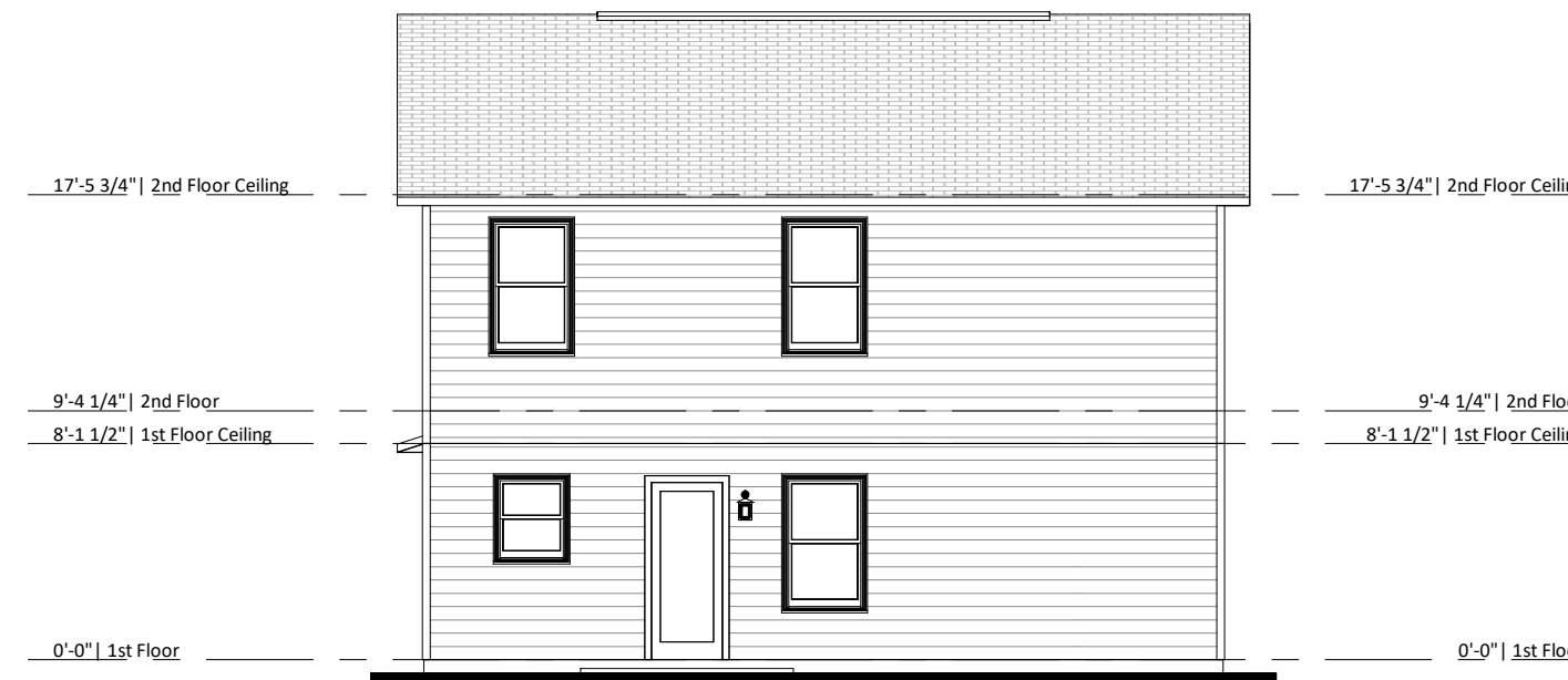
2 Rear Elevation - Elev A - 1 Car Garage 1/8" = 1'-0"