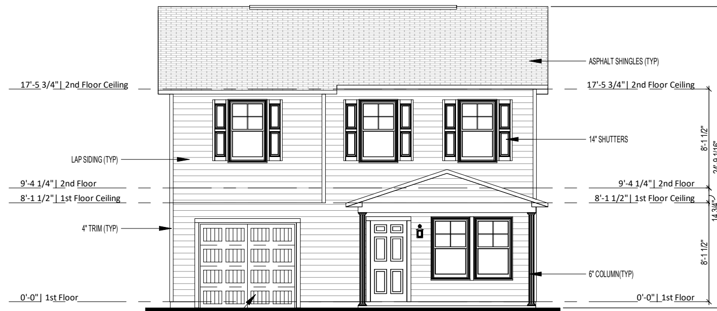
1 Front Elevation - Elev A - 1 Car Garage 1/8" = 1'-0"