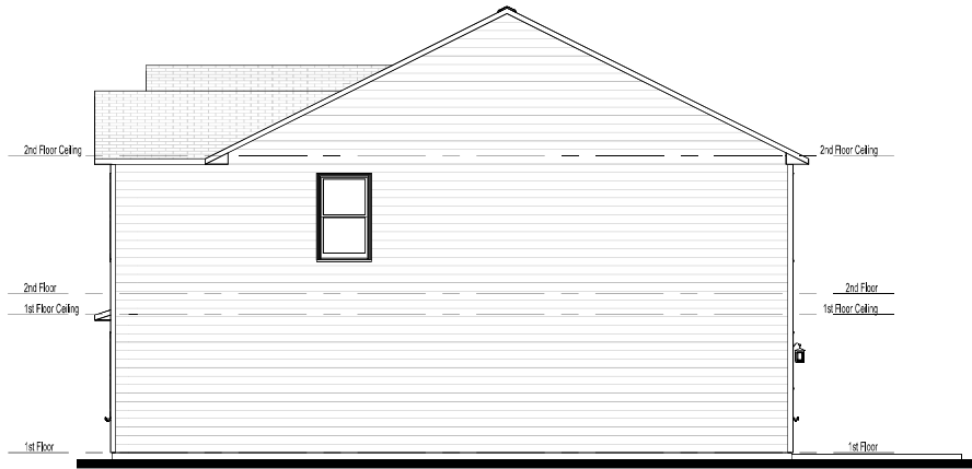
① Right Elevation - Elev A 1/8" = 1'-0"