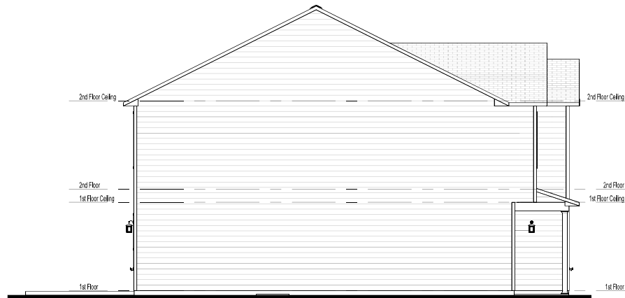
② Left Elevation - Elev A 1/8" = 1'-0"