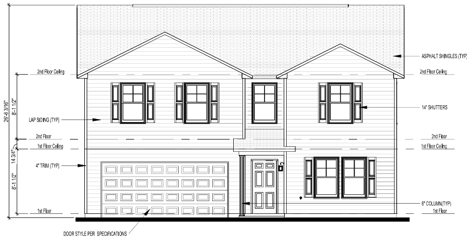
1 Front Elevation - Elev A 1/8" = 1'-0"