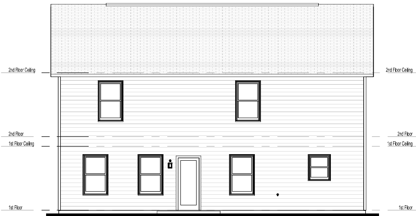
2 Rear Elevation - Elev A 1/8" = 1'-0"