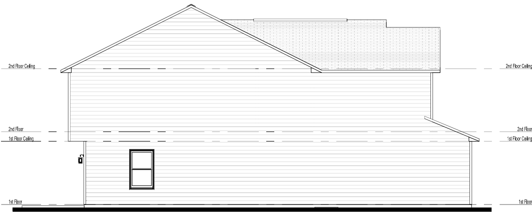
① Left Elevation - Elev A 1/8" = 1'-0"