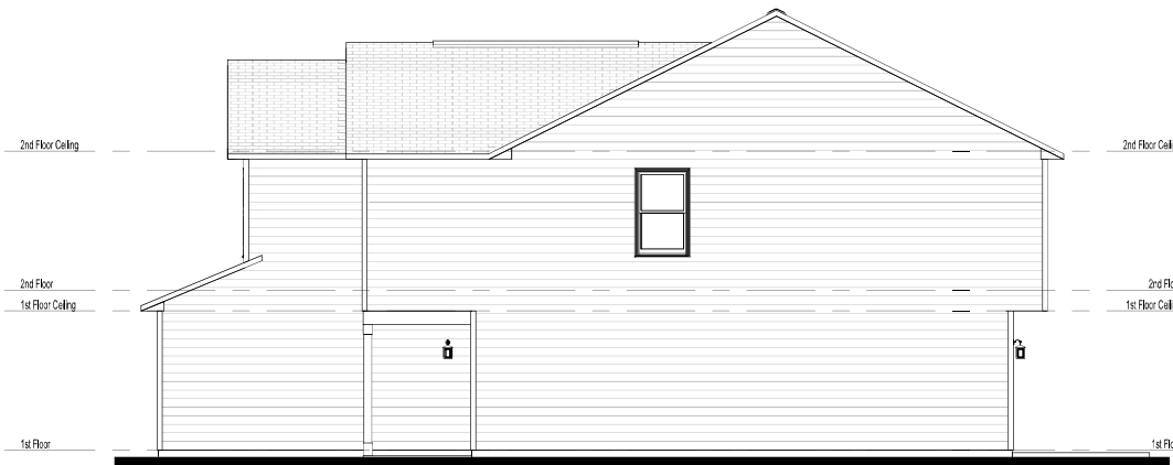
② Right Elevation - Elev A 1/8" = 1'-0"