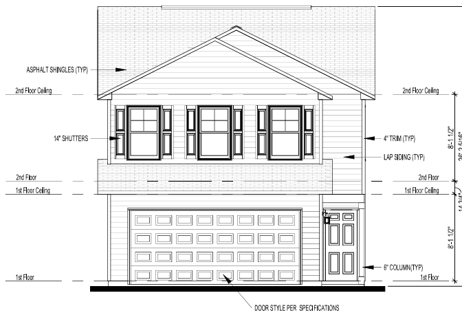
1 Front Elevation - Elev A 1/8" = 1'-0"