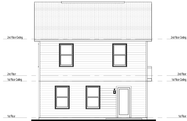
2 Rear Elevation - Elev A 1/8" = 1'-0"